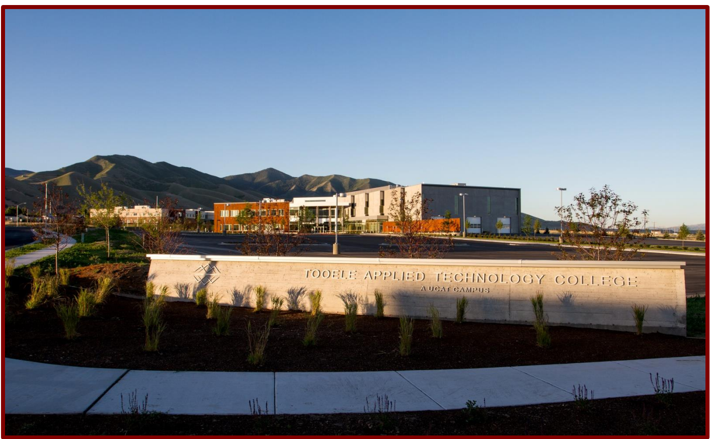
Tooele Applied Technology College: Opened June 5, 2013 UCAT's Newest Official Campus