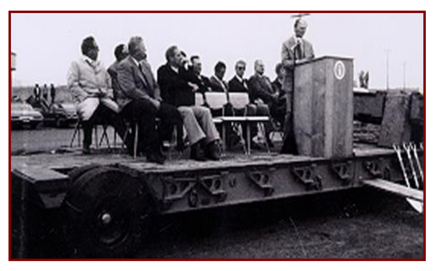
Initial meeting: Uintah Basin Area Vocational Center, Sept 1968 UCAT's First Official Campus