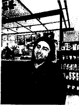
Murray, Utah 84107