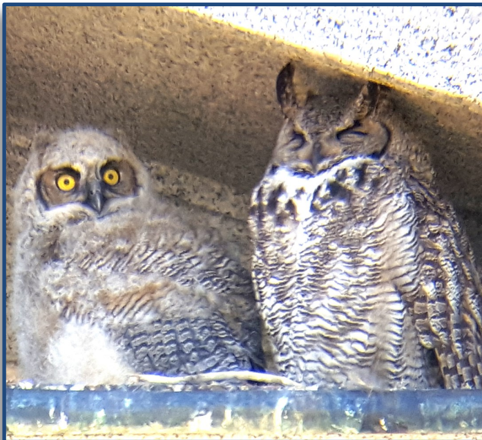
Nesting owl and owllet this spring on north side of Capitol