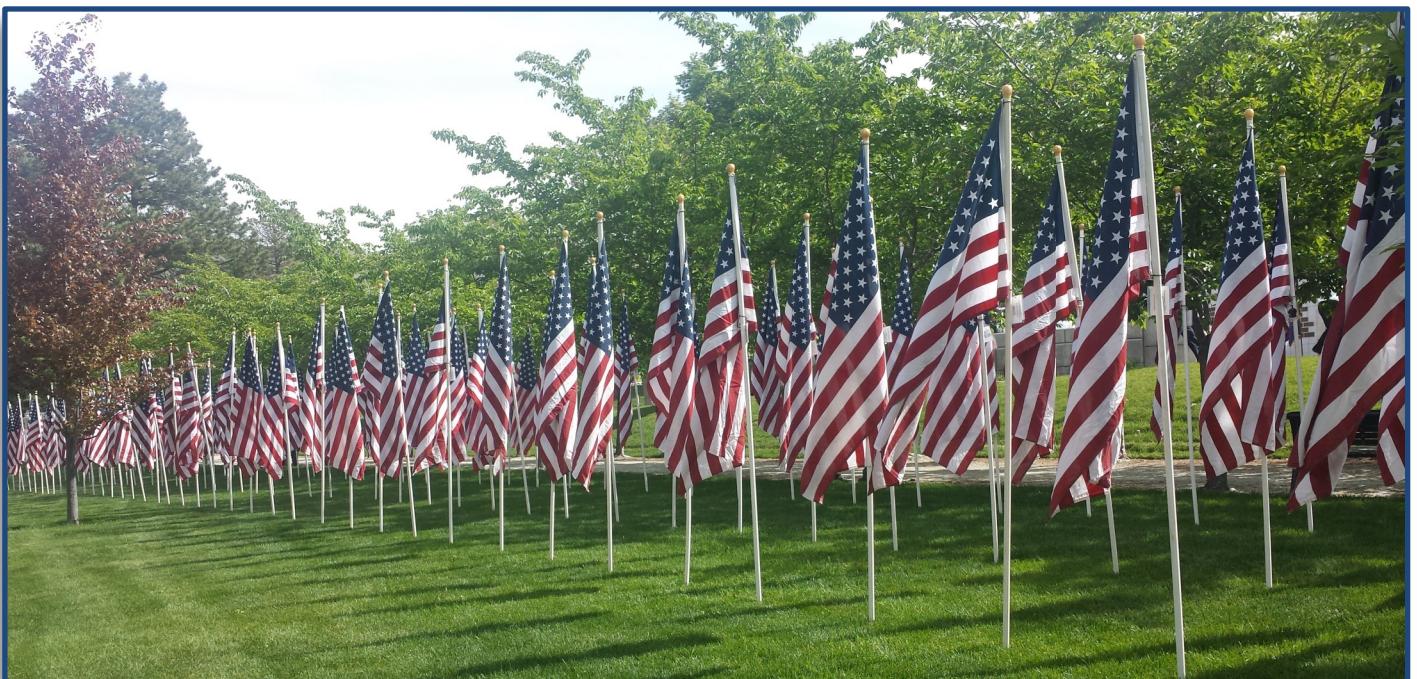
Flags at the Annual Law Enforcement Memorial Service