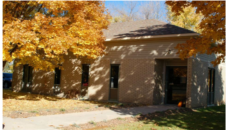
CFSC-South Building. Dedicated October 21, 2013

The Logan, Utah facility has surpassed capacity. These astonishing growth rates at the Logan facility combined with population increases in the County instigated a community wide needs assessment in 2011 with the goal of examining needs for supportive services at the south end of the community.