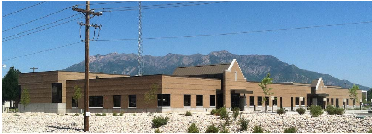
Security Forces Squadron Building