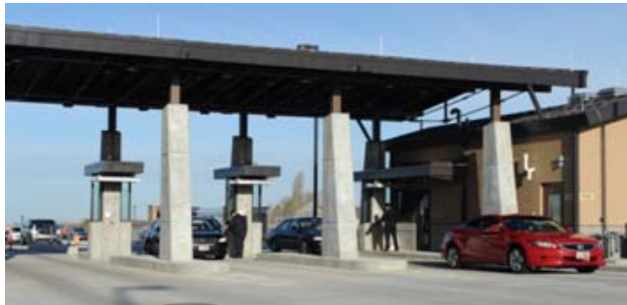
New West Gate