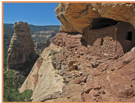
Photo: Cultural Site in the Abajo Mountains