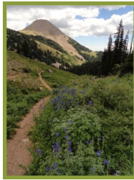
Photo: La Sal Mountains

The National Forest Management Act (NFMA) of 1976 requires that each forest create a land management plan. Known as Forest Plans, these land management documents guide management of National Forest lands to provide for multiple-uses and a range of social, economic, and ecological benefits for the present and future.