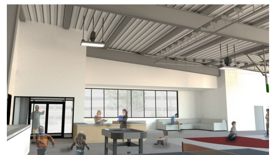
25 YEARS YOUTH IMPACT EDUCATION CENTER CAPITAL CAMPAIGN