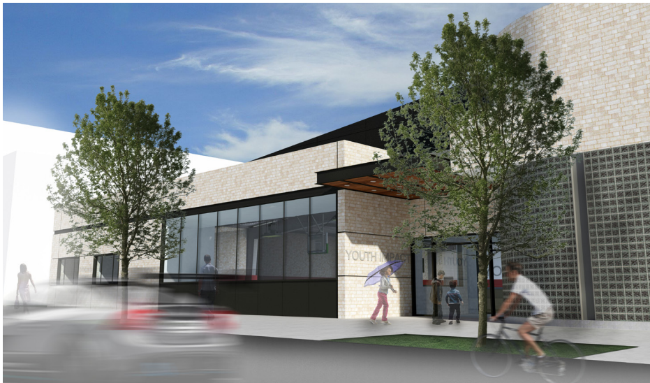
25 YEARS YOUTH IMPACT EDUCATION CENTER CAPITAL CAMPAIGN