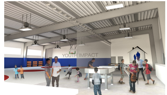
25 YEARS YOUTH IMPACT EDUCATION CENTER CAPITAL CAMPAIGN