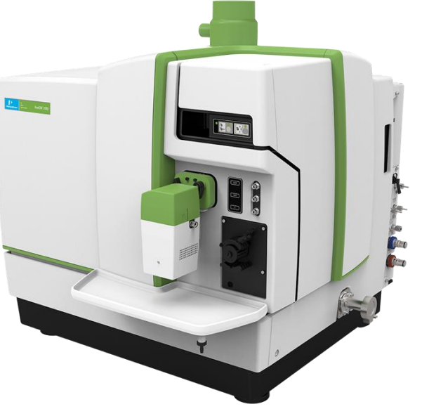
Figure 1 Perkin Elmer NexION2000