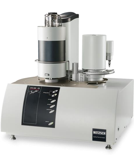
Figure 2 Netzsch STA 44 F5 Jupiter