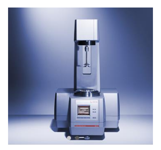
Figure 4 Anton-Parr MCR 502 Rheometer