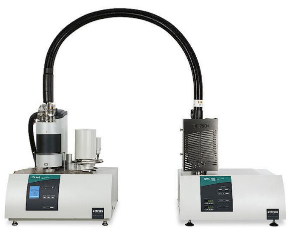
Figure 3 STA coupled with a mass spectrometer