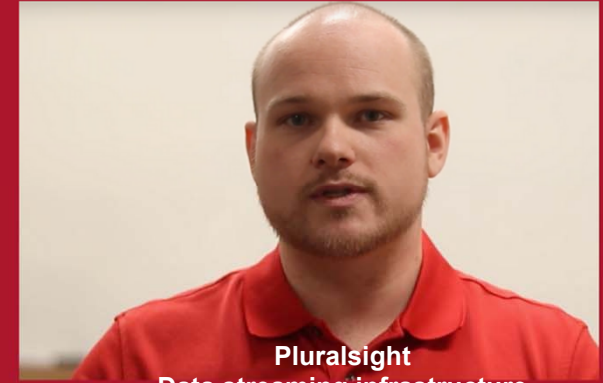
Pluralsight Data streaming infrastructure engineer