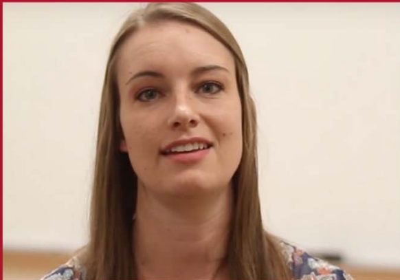
Broadcom Inc. R&D software engineer