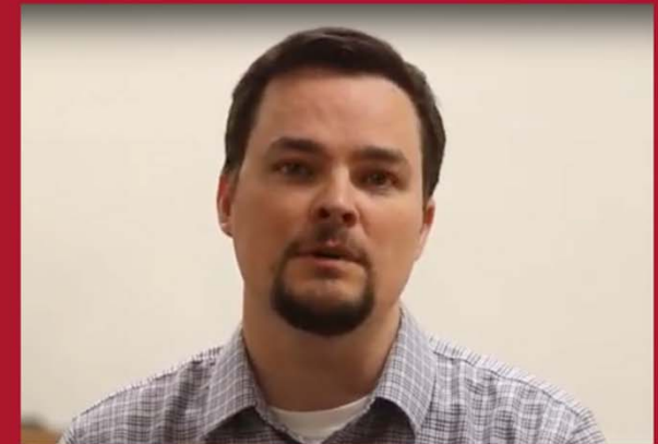
L3Harris Technologies Software engineer