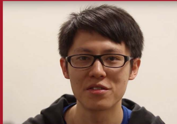
Microsoft Software engineer