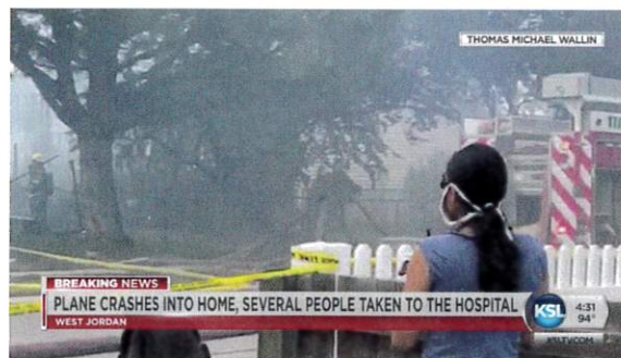
News story from a West Jordan crash July 25, 2020

Four dead in American Fork plane crash 7-3-2020