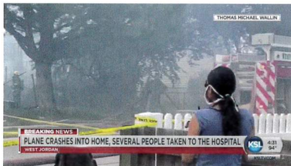
News story from a West Jordan crash July 25, 2020

Four dead in American Fork plane crash 7-3-2020