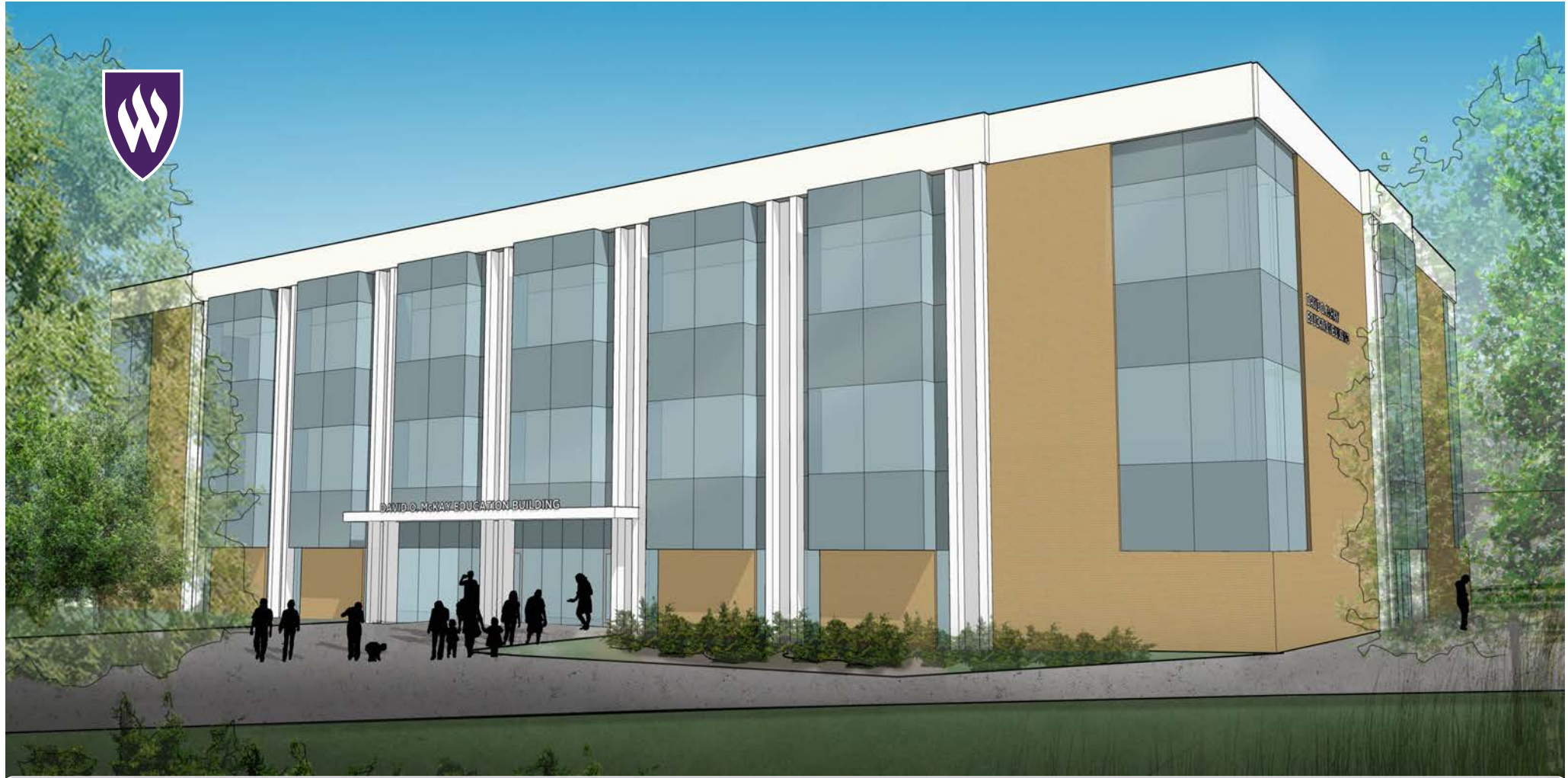
Renovated McKay Education Building