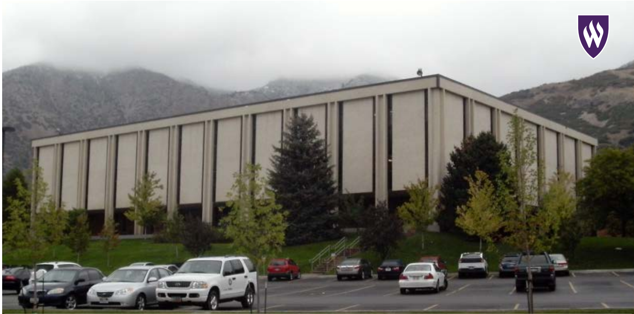
Former Social Science Building