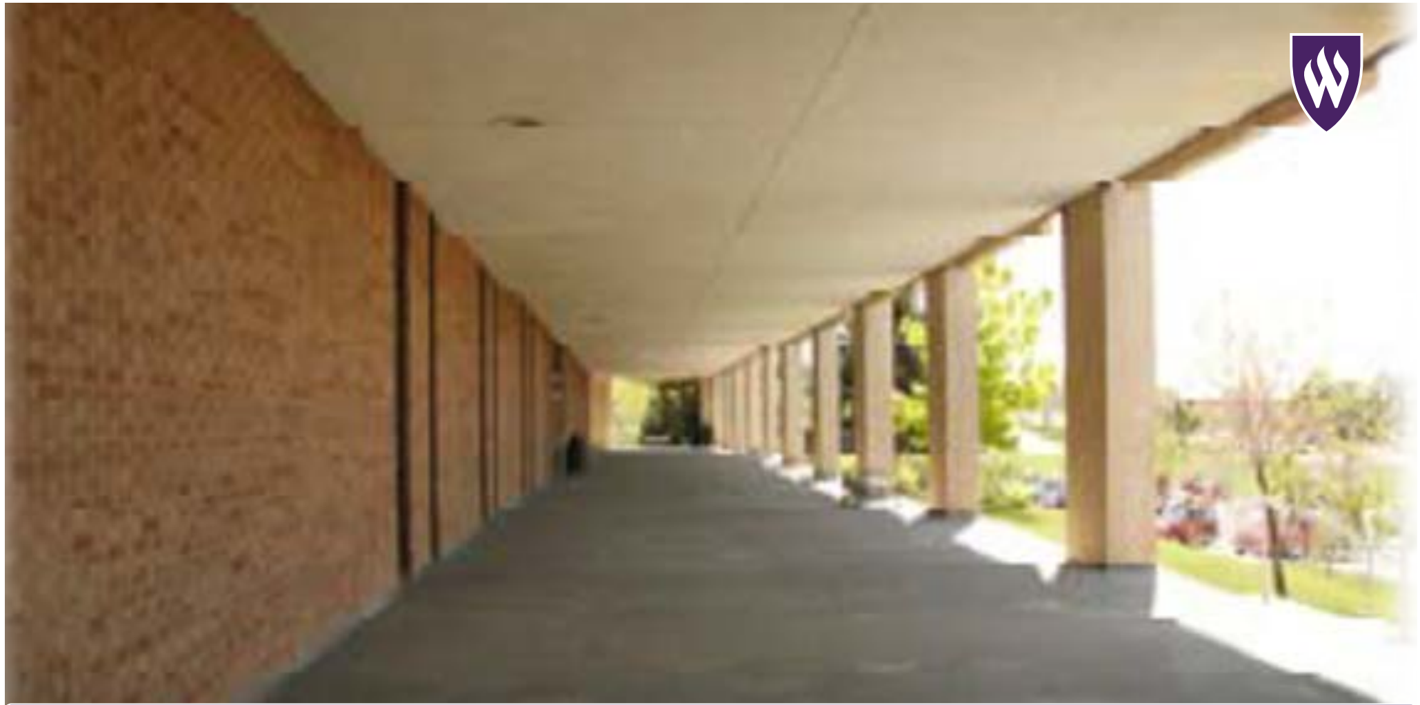
Former Social Science Building Patio