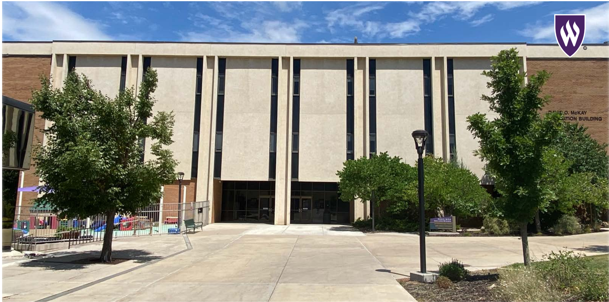
David O. McKay Education Building