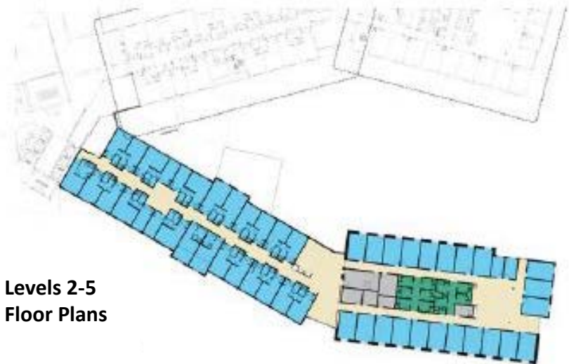
Levels 2-5 Floor Plans