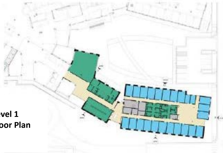
Level 1 Floor Plan