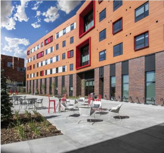
New Exterior Courtyard