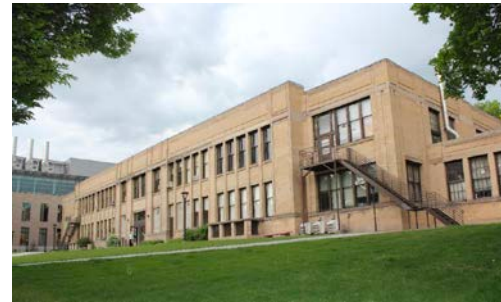
The 1919 William Stewart Building

The University of Utah requests approval to bond to cover donation funds that will be received over time