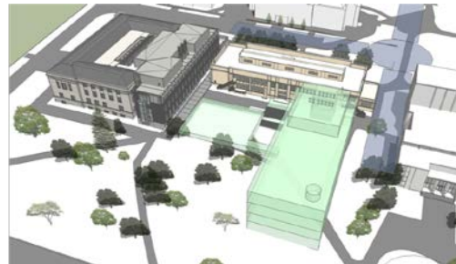
Aerial view from University Street