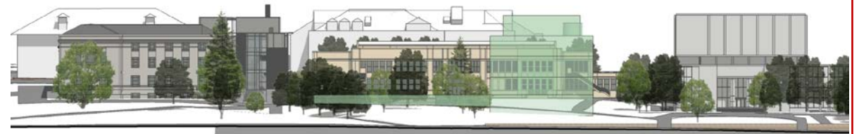
View from University Street