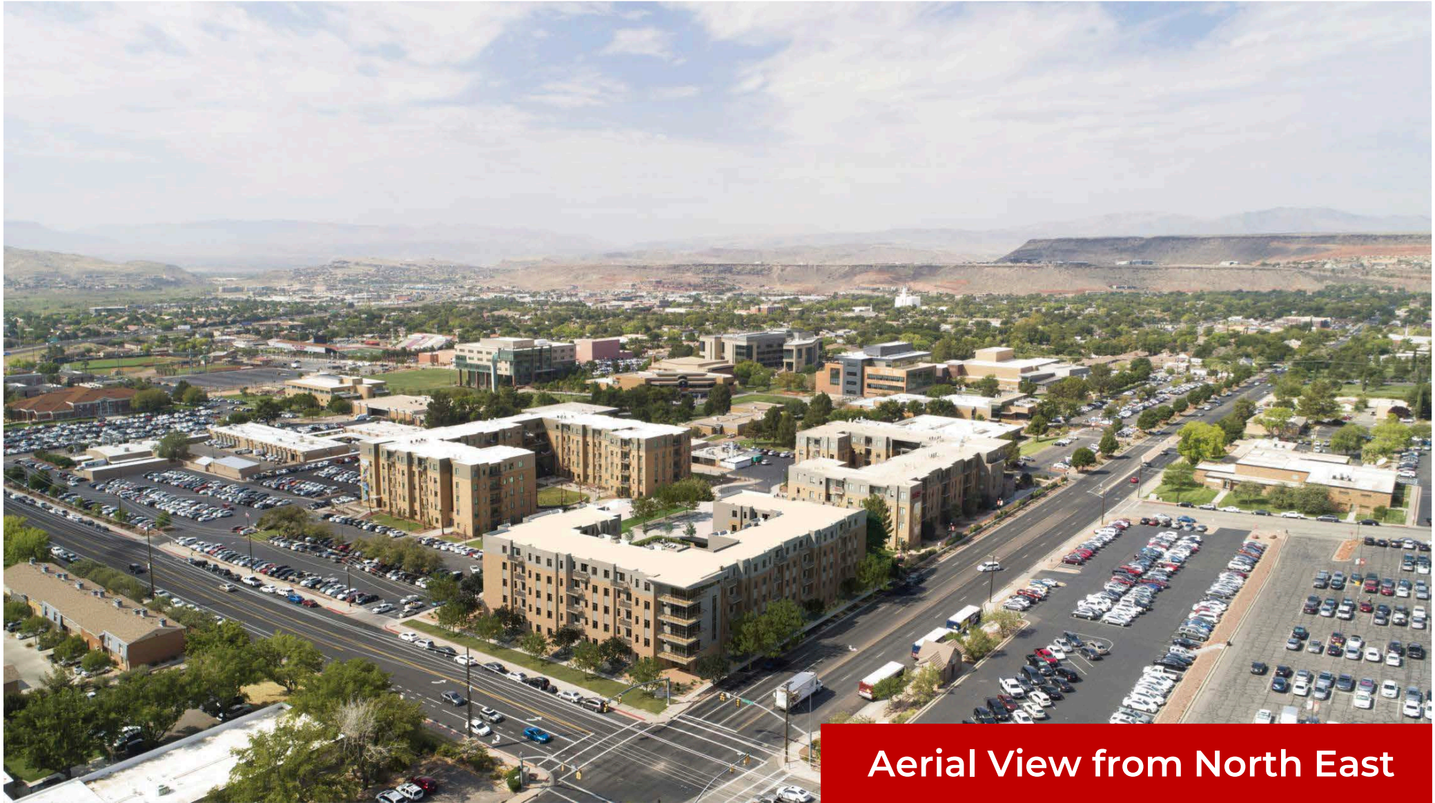
Aerial View from North East