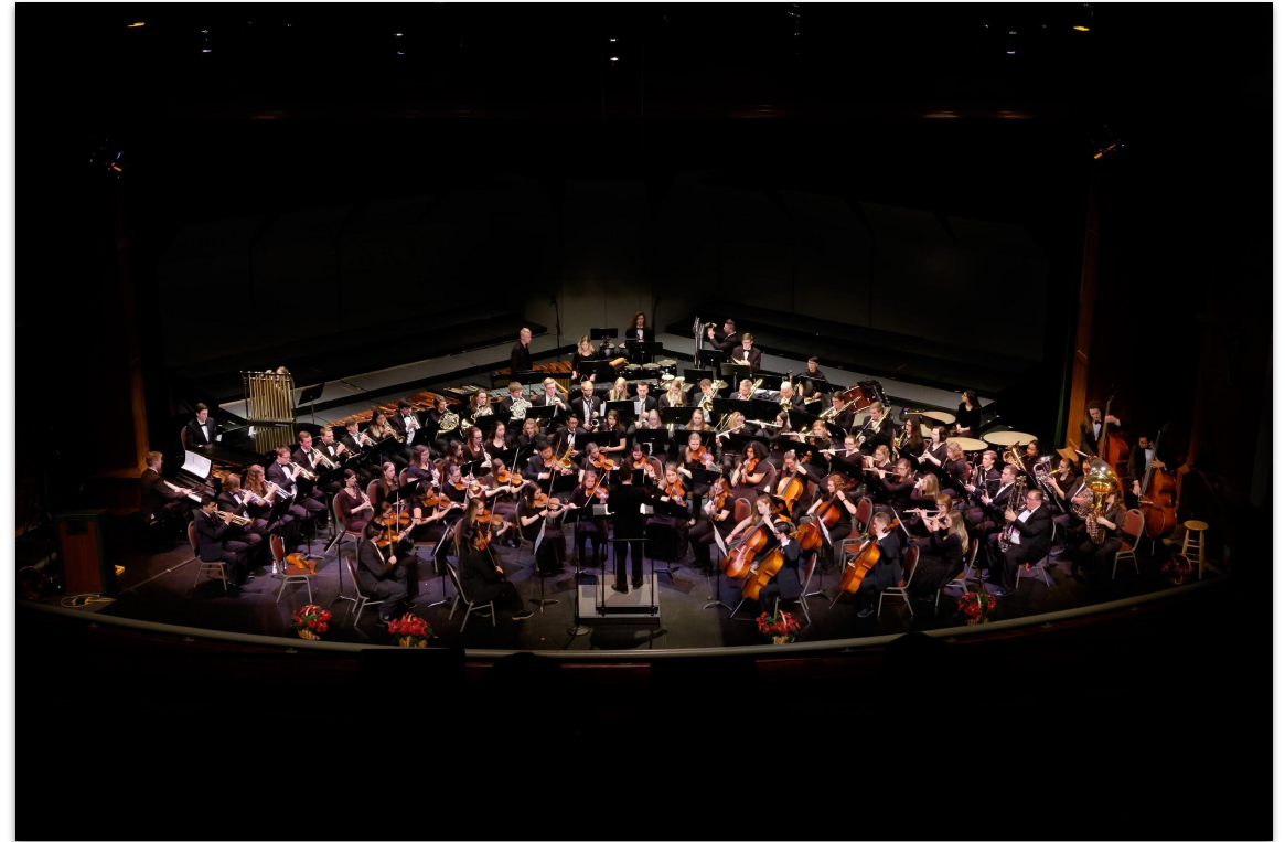
SUU's Orchestra Cedar City Heritage Center Theatre (Off- Campus Rented Space)