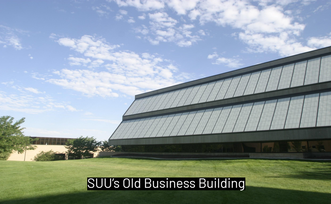
SUU's Old Business Building