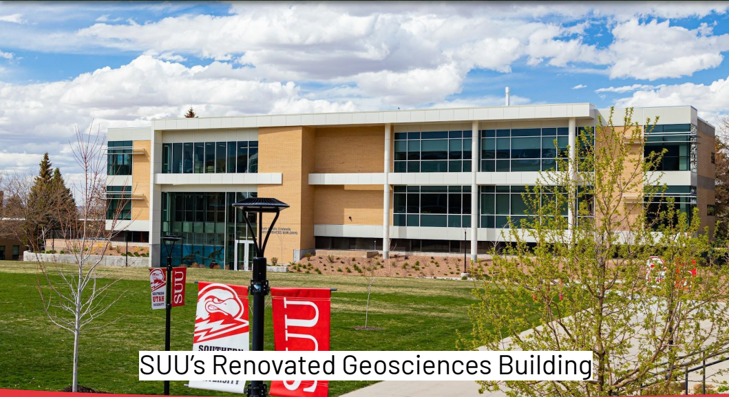
SUU's Renovated Geosciences Building

Renovation of the Music Center saves the State of Utah $10-15 million over the cost of replacement.