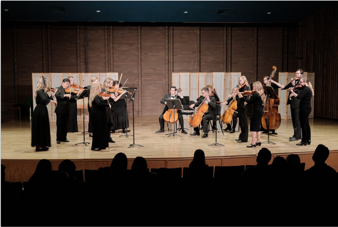
SUU's String Ensemble at Thorley Recital Hall (On-Campus)