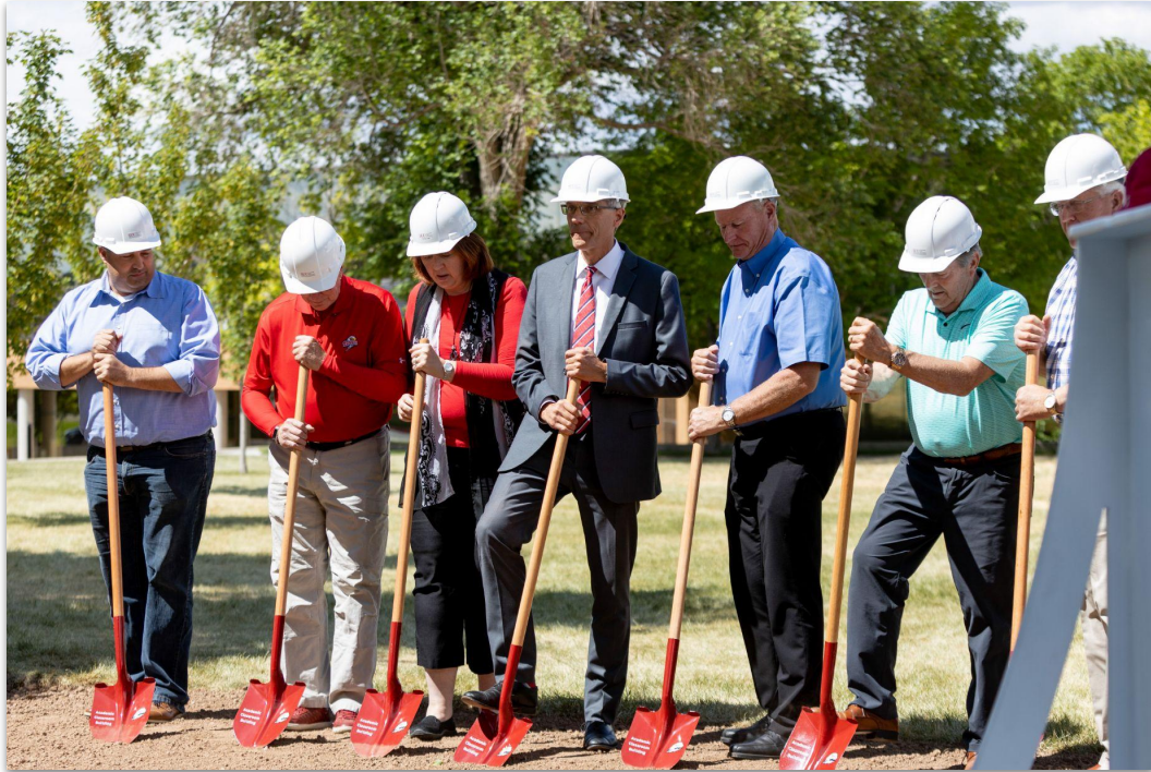
Groundbreaking | June 25, 2021