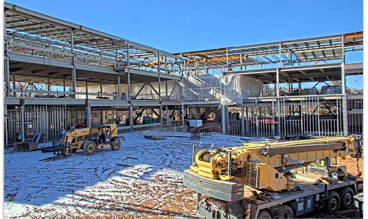
Construction | January 24, 2022