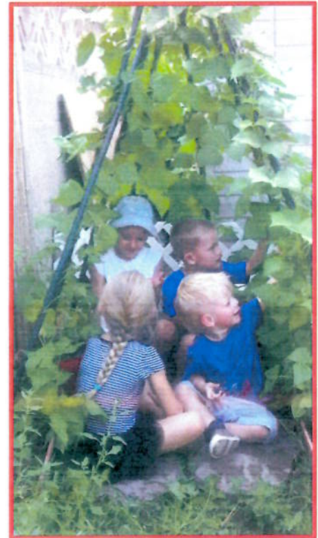
Bottom: Farm to summer celebration in Tooele School District, 2019.