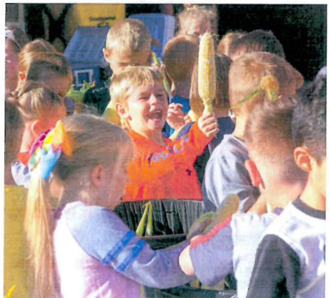
Corn husking competition in Box Elder School District, 2019

The Farm to School Commission will help transform individual activities into a cohesive movement that strengthens our local food economy.