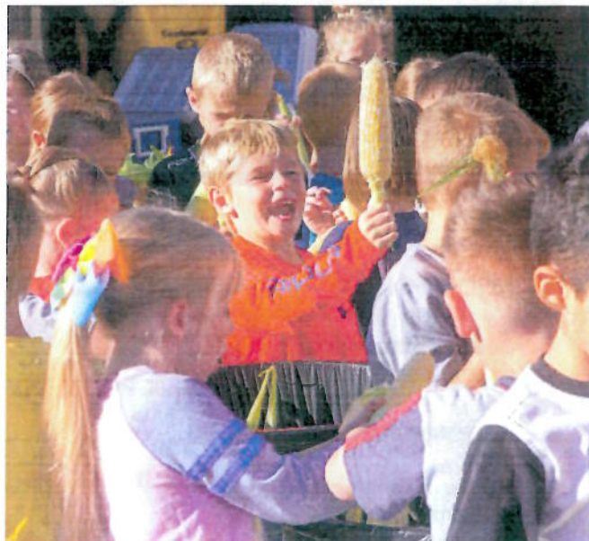
Corn husking competition in Box Elder School District, 2019

The Farm to School Commission will help transform individual activities into a cohesive movement that strengthens our local food economy.