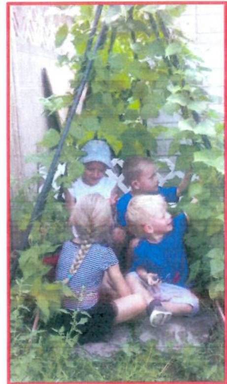
Bottom: Farm to summer celebration in Tooele School District, 2019.