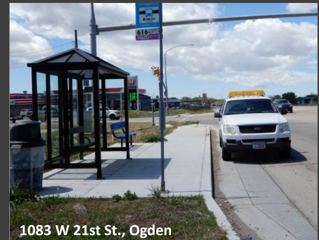
1083 W 21st St., Ogden