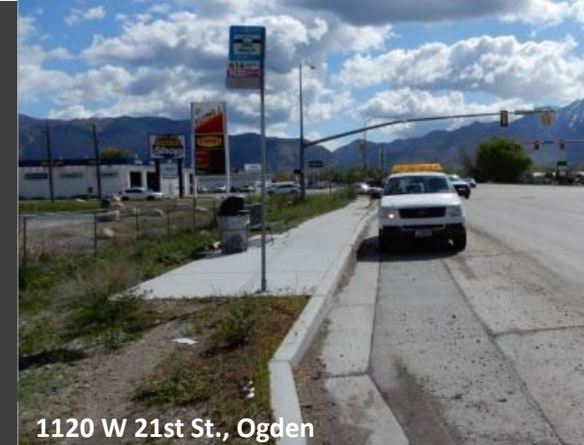
1120 W 21st St., Ogden