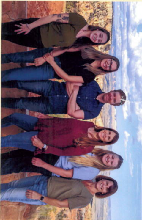
Listing from left to right: