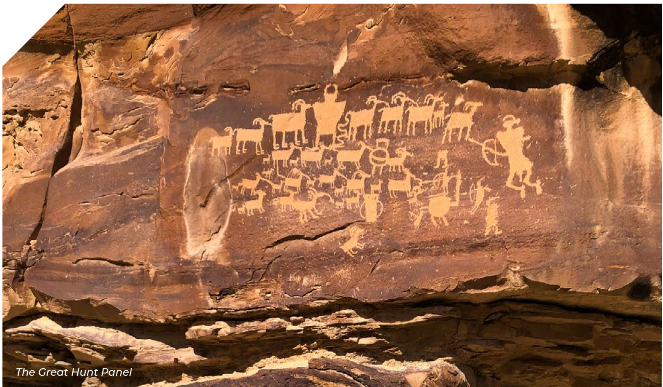
The Great Hunt Panel

Valence Resources drilled the first successful helium well in the Paradox Basin of southeastern Utah. The Jesse 1A well is located on Trust Lands in San Juan County and is the first well, outside of Harley Dome in east-central Utah,