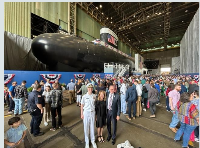
USS Iowa Christening June 2023