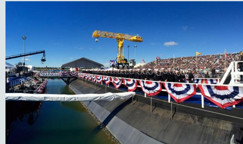
USS Illinois Commissioning October 2015