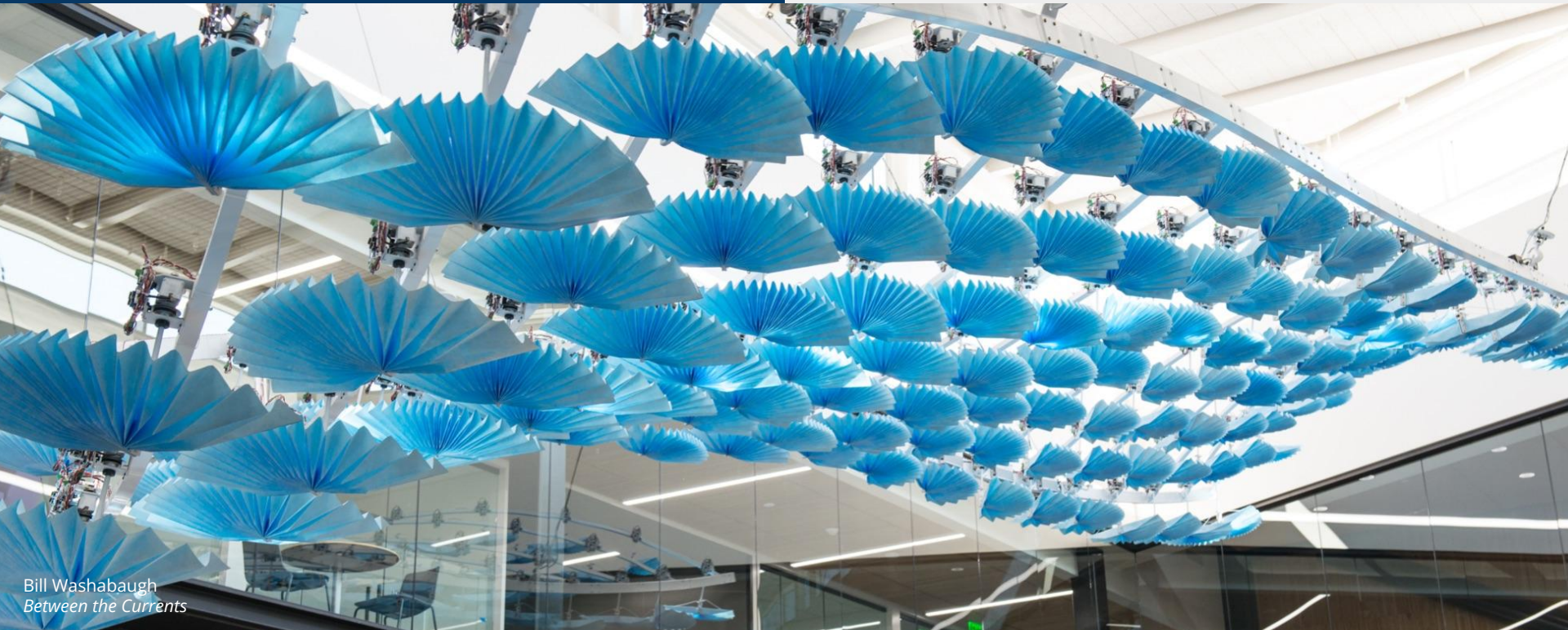
Bill Washabaugh Between the Currents