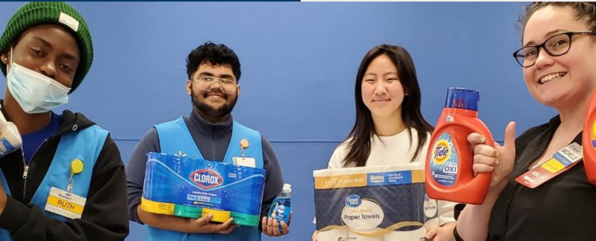
Engaging Utah's Youth Through Service