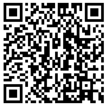
UTNG Annual Statistical Report