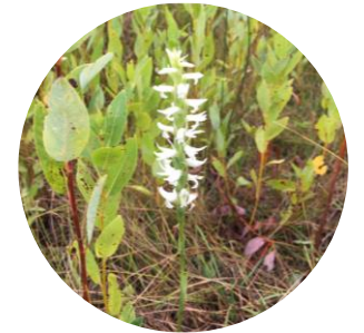
UTE LADIES' TRESSES

Proposed for downlisting from endangered to threatened in 2021