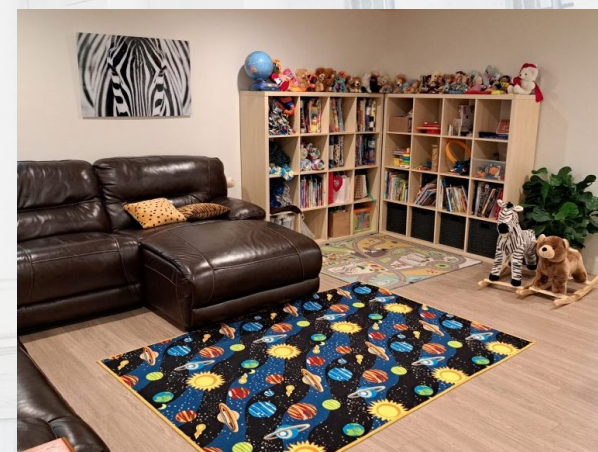
Summit County Children's Justice Center