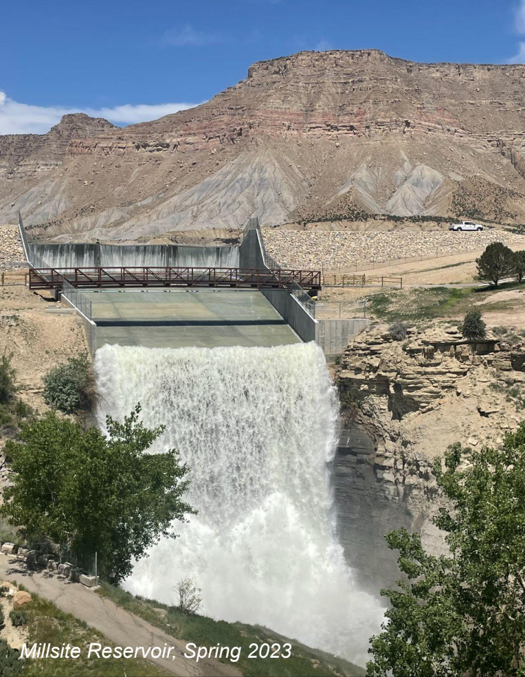
Millsite Reservoir, Spring 2023