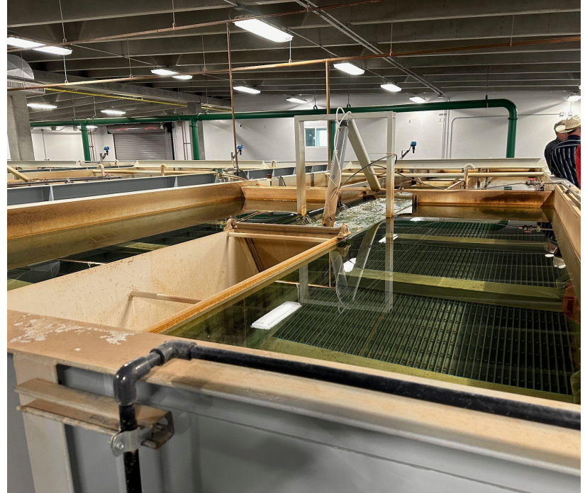
Ashley Valley Water Treatment Plant