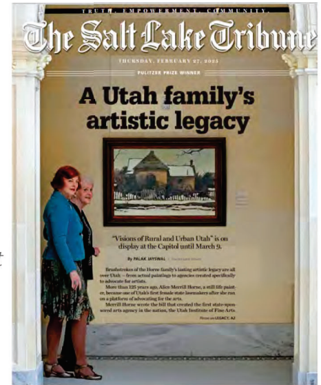
Capitol Preservation Board curated-exhibit cover story, Salt Lake Tribune , February 26, 2025