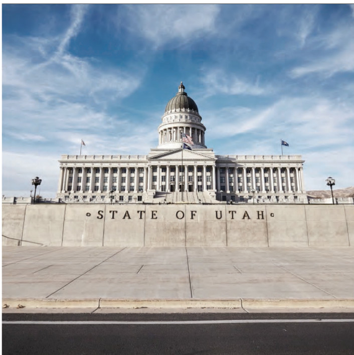
Previous State of Utah wall