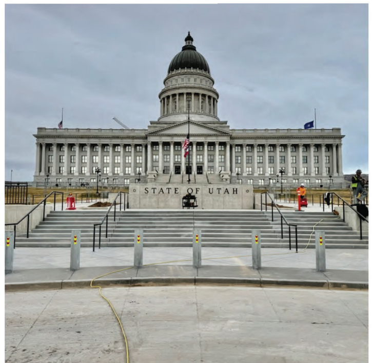
New State of Utah wall with traffic circle