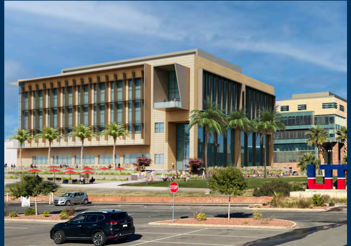
Encampment Mall Rendering