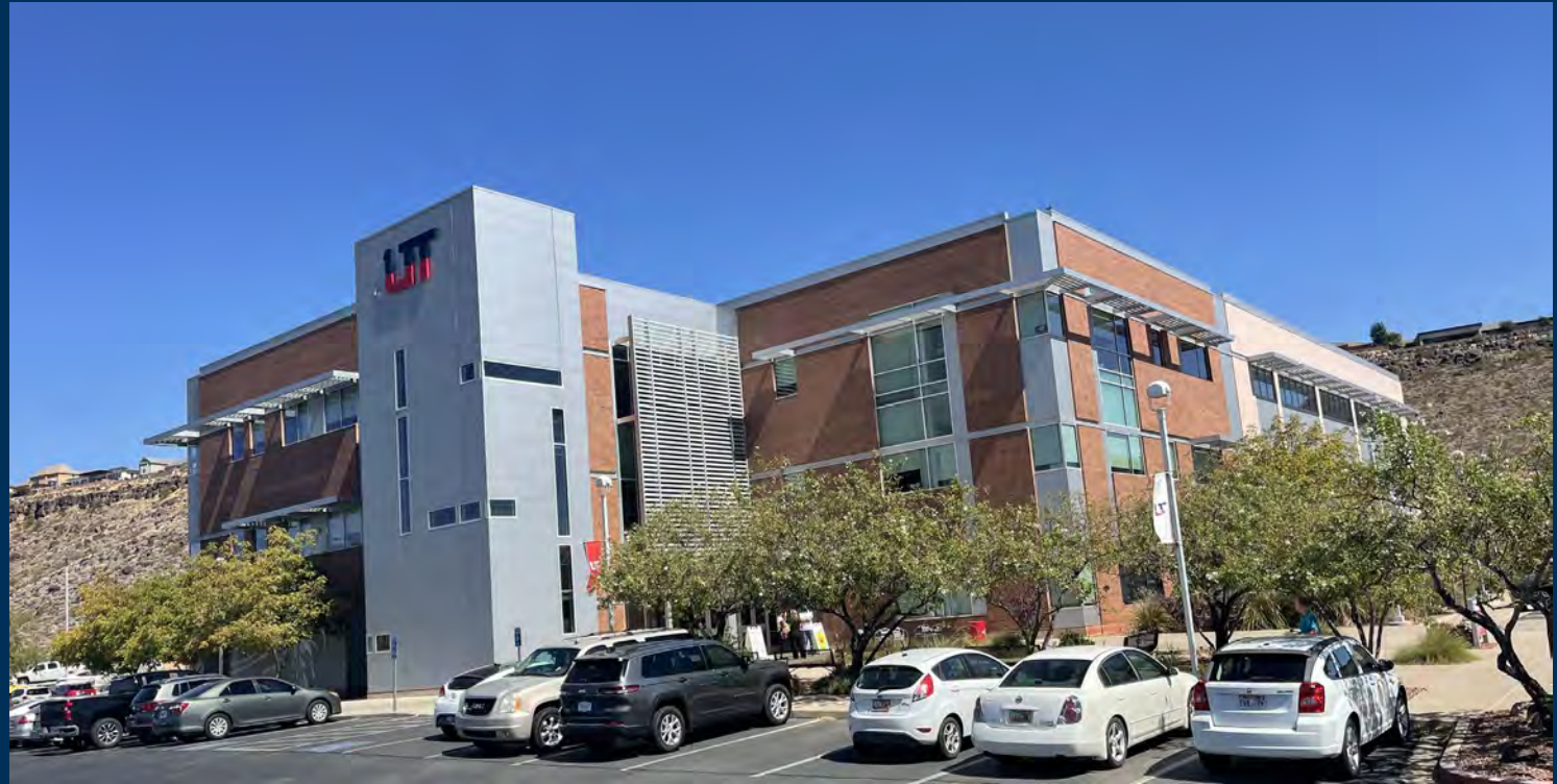
Taylor Health Sciences Building