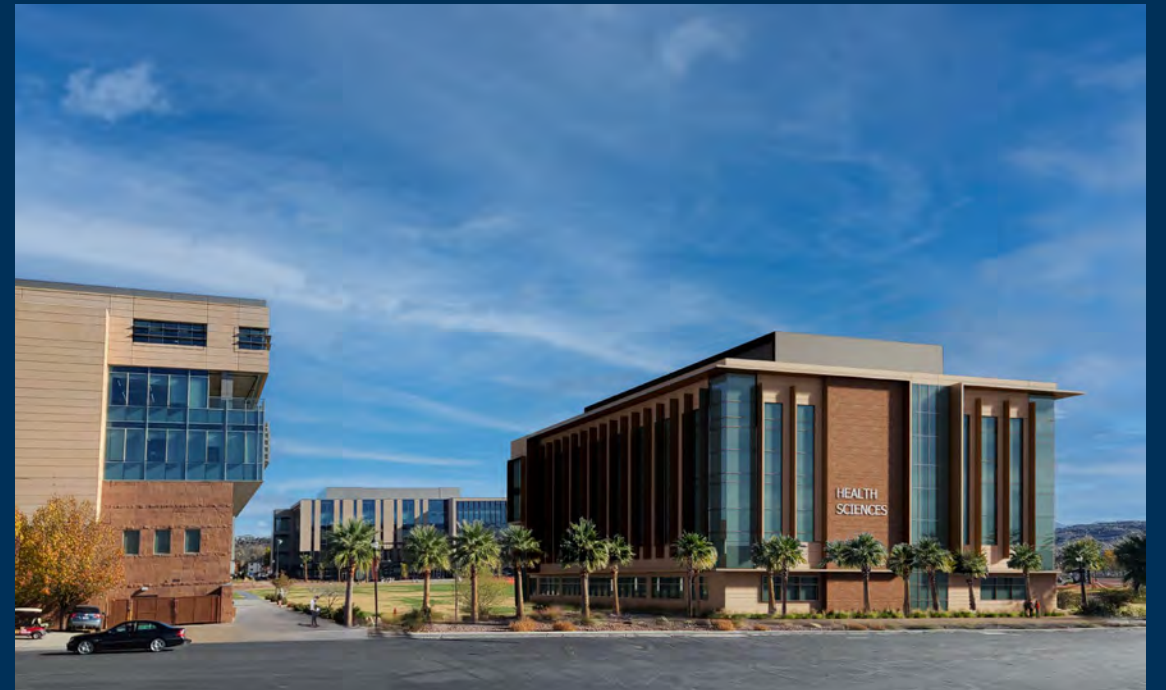
Northwest corner rendering