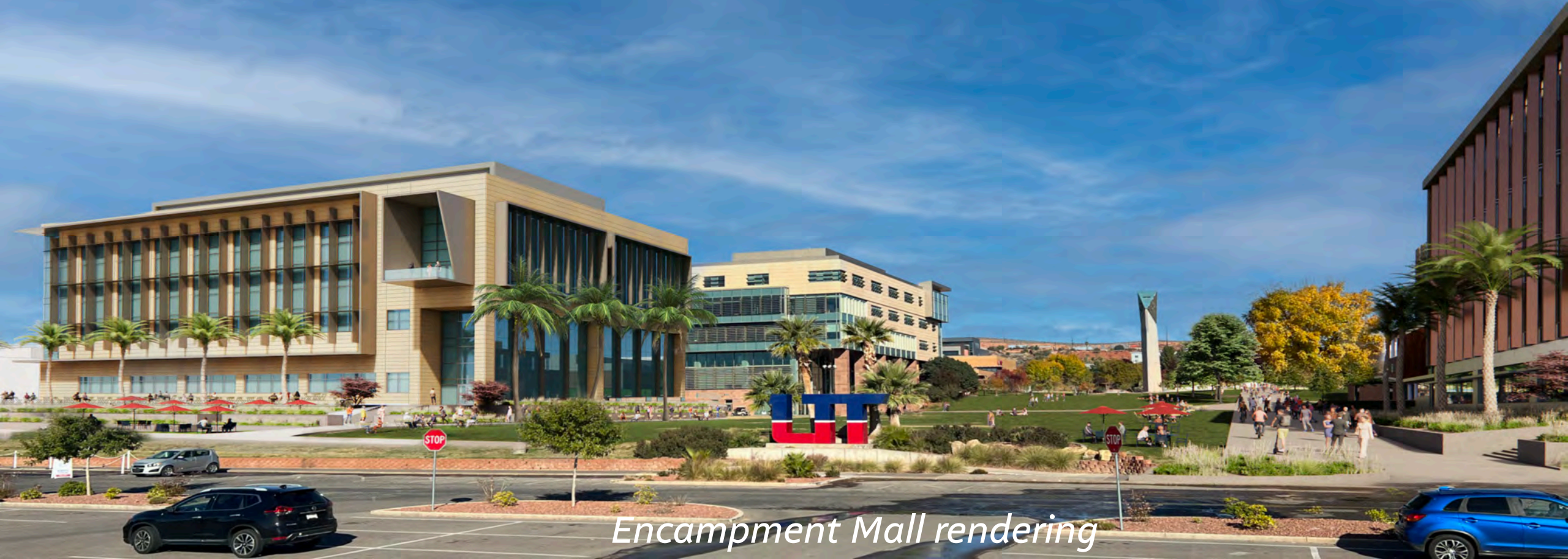
Encampment Mall rendering